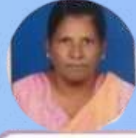
Jyotsna Support Staff